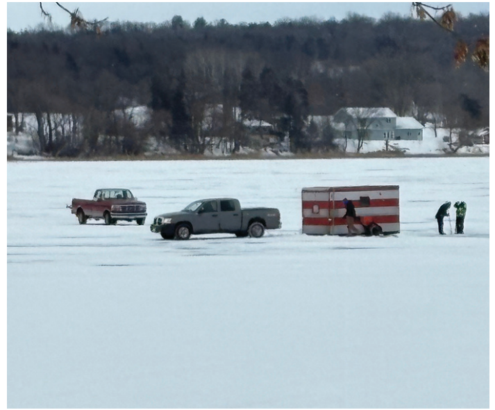
Ice fishing fans at the end of December came with trucks towing fish houses. The thicker the ice, the bigger the house. Ice was reported at 10 to 14 inches by the end of 2025.