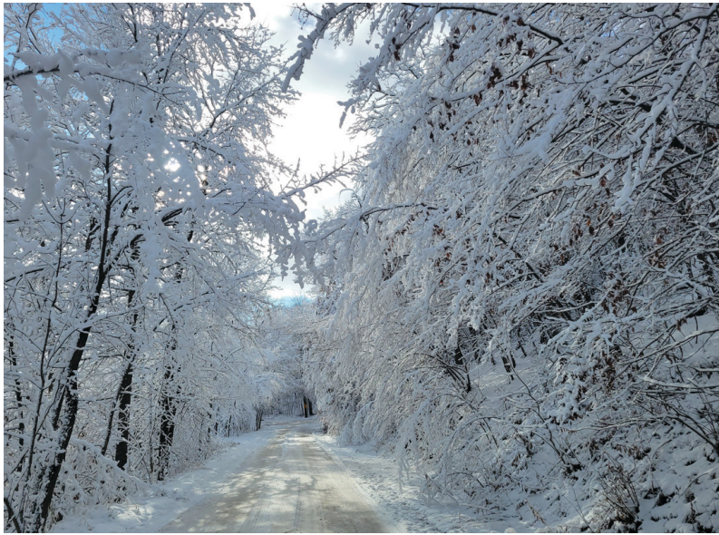
A winter wonderland has blanketed the Big Birch Lake area for much of December and into January. It is easier to appreciate the four seasons when the coldest season reveals its unique beauty.