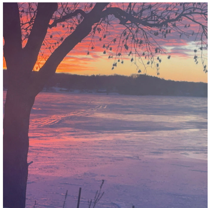
The beauty of sun rising over Big Birch Lake in December is awesome. The colors reflected on the surface of the ice are surprising from day to day.

A quorum at a general membership meeting shall consist of one-tenth of the total voting membership and is required to conduct Association business at any duly called meeting. Section 5. A quorum at a Board of Directors meeting shall consist of one-third or more of the total number of elected or appointed directors of this Association and is required to