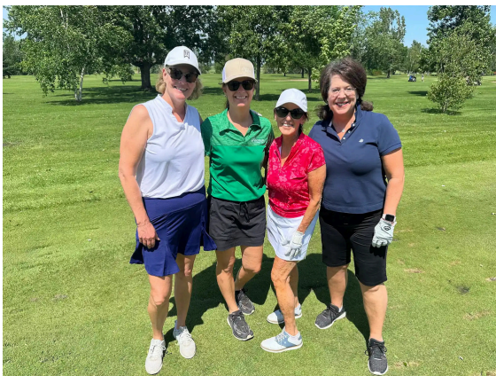
"Chicks with Sticks" -