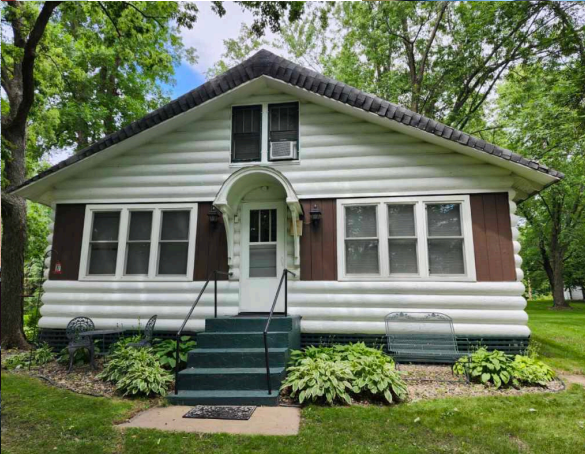
Tony Niehaus drives a classic wooden run-about, owns a classic Big Birch cabin and was a classy water skier.