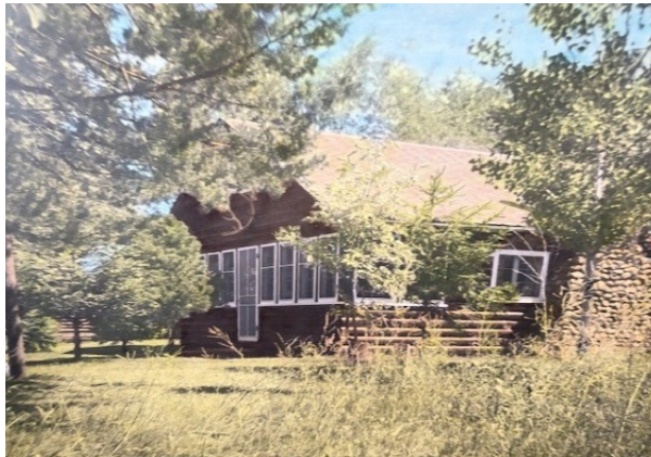
This is the original Lundeen cabin typical of cabins built in the 1930s-1950s. The cabin was recently torn down.

pen Drive and stop at the cabins to ask people if they had leftover food when they were packing to go home after the weekend. Darrell recalls one time when a neighbor's chicken got run over on the road. Blackjack picked it up supposedly for a roadkill dinner. Glider also taught Darrell that he need not fear poison ivy. Blackjack picked the poison plant and rubbed it on his arms and legs. Darrell didn't buy it.